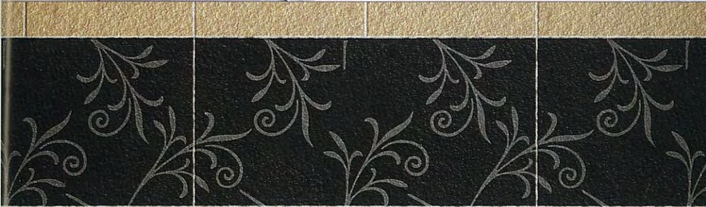
Mera Bushhammer Tiles by MML

EVERY HOME COMES COMPLETE WITH ITS OWN ART COLLECTION