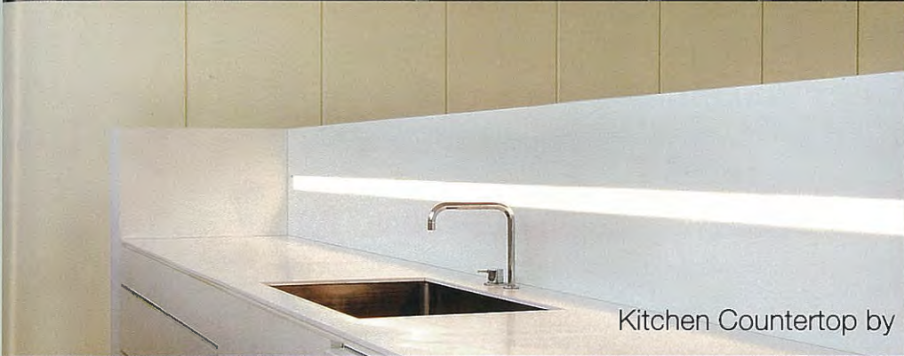
Kitchen Countertop by DuPont™ Corian®